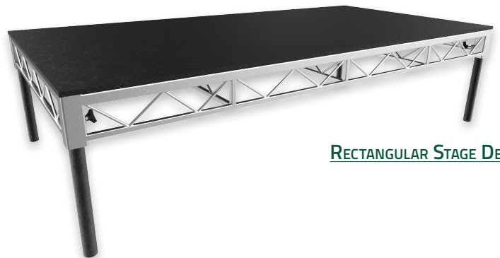
RECTANGULAR STAGE DECK