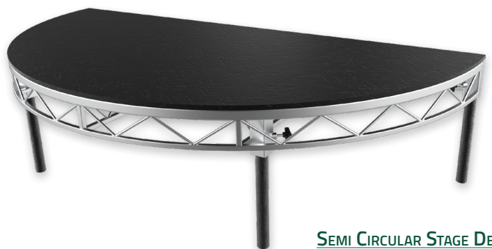
SEMI CIRCULAR STAGE DECK

*For further CLSA components and accessories please visit our website at cls.com.au or alternatively call our office on (03) 9646 8890 to speak with one of our sales personnel